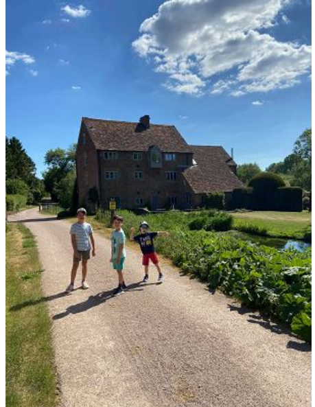
Lovely old mill house on the way back to St Albans